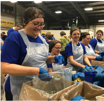
Twelve Peoples employees were part of a 325+ strong volunteer force who packed more than 48,000 bags of trail mix as part of the United Way Emerging Leaders of Marathon County's Smack Hunger event. The bags will be donated to the Marathon County Hunger Coalition and local agencies.