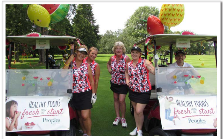
Congratulations to our Peoples team that played in the Aspirus Women's Golf Outing! They tied for first place at the event.