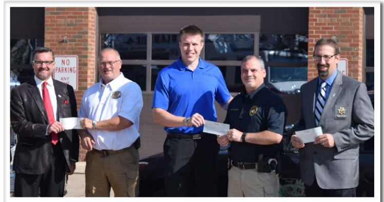
A big thank you to everyone who joined us on Friday, August 10, for our annual brat fry where all the proceeds went to the Rhinelander Police Department, Rhinelander Fire Department, and Oneida County Sheriff Department.